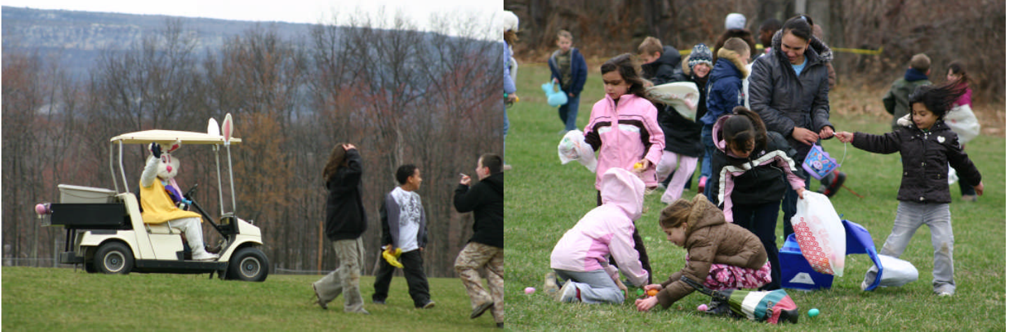
Above: Despite a cold, windy day, the Easter Bunny made his annual appearance at the Thomas Felten Park on April 4.

If you have not yet checked out the Town of Plattekill website, log on to www.town.plattekill.ny.us for the following information: