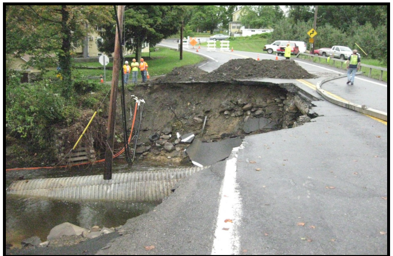
Photo of Route 44-55 looking east in Clintondale, NY. Reclassified as a "tropical storm by Sunday August 28, 2011, Hurricane Irene washed out the entire west-bound lane of this state road. The road is closed until sufficient repairs can be made. State inspectors are seen in the background, assessing the road damage and needed repairs.