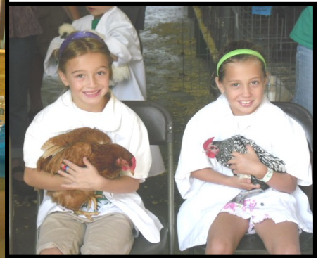
Getting ready to show their chickens!