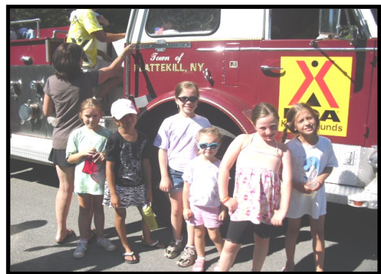
Girl Scouts from Troop 60042 after their ride on the KOA retired fire truck.

This summer the girls from Girl Scout Troop 60042 spent a weekend at our local KOA learning camping skills including meal preparation, how to put up a tent, and of course, how to eat smores! If you are interested in learning more about how to become a Girl Scout or leadership opportunities in Girl Scouting, contact Donna Egan at Vank100@aol.com .