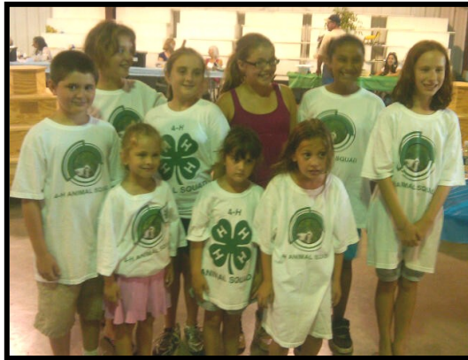
Plattekill 4-H group in their 4-H shirts at the fair.