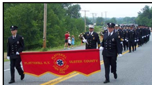
Plattekill Fire & Rescue