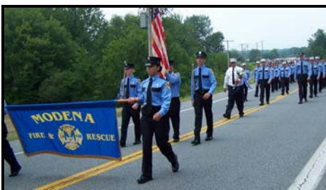
Modena Fire & Rescue

The Modena Fire Department is to be congratulated on the fine job they did hosting the Ulster County Volunteer Firefighter's Association Parade and convention on July 28 th . However, they weren't alone in their efforts. Many nearby fire departments, rescue squads, town, county and state police units helped throughout the day. Other participants included the Town of Plattekill Town Board, the Air National Guard Color Guard, the Ulster County Bureau of Fire, and several marching bands. It was a massive effort that was very well coordinated. The day started with the judging of trucks at 9 AM and the parade stepped off at 1 PM. The day was hot and humid, but that didn't stop the participating fire departments from sporting their best uniforms, showing off their gleaming trucks, marching past crowds along Freetown Highway, Route 44/55, Route 32, then ending at the town park.