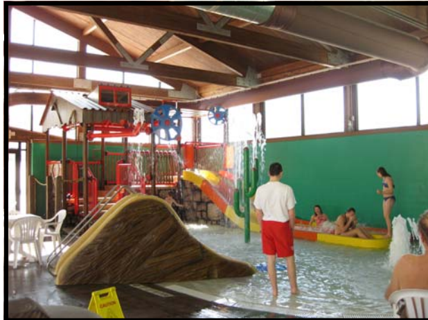
The indoor water park was a big hit with visitors.

Over 100 residents enjoyed Plattekill Community Day at Rocking Horse Ranch on March 7 th . Attendees were allowed to use all of the facilities. The new water park was a favorite by far!