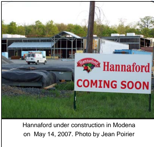
Hannaford under construction in Modena on May 14, 2007.