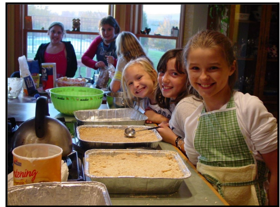
Girls from Girl Scout Troop 60332 prepare apple crisp.

Girls from Girl Scout Troop 60042 spent the day cooking a turkey dinner for a local needy family as part of a community service 'adopt a family' program. After cooking the meal, several