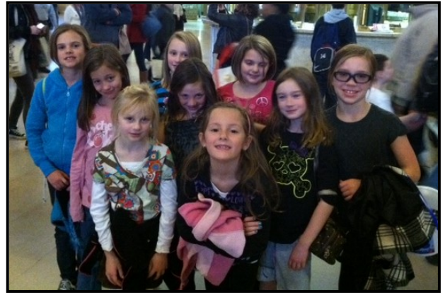
Girl Scout Troop 60042 in Grand Central Station

Girls from Girl Scout Troop 60042 were lucky enough to take a trip into New York City for the Radio City Christmas Spectacular the Friday after Thanksgiving. The photo above right, was taken in Grand Central Station on their way to see the show. For more information on joining Girl Scouts contact Donna Egan at vank100@aol.com